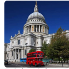
Bright Lights, Big City