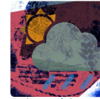
Rain and Sunrays