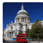
Bright Lights, Big City